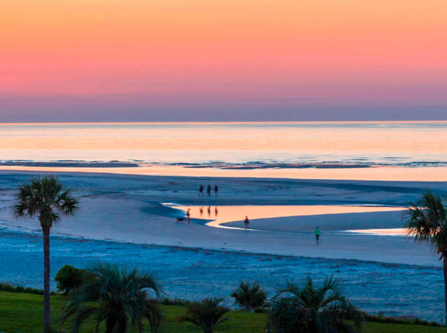
2024 SPRING SCIENTIFIC SYMPOSIUM May 16–19, 2024 Sea Island Resort, Sea Island, GA